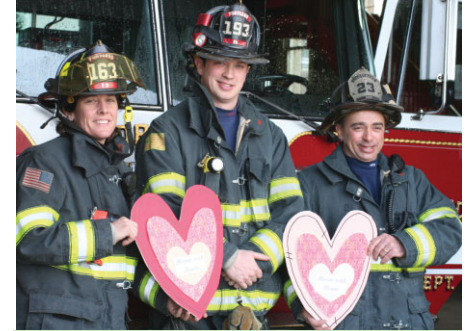
Portland Firefighters prepare for Heroes with Heart .

TIP volunteers invited to participate in Cumberland County Disaster Drill. TIP volunteers joined first responders from Cumberland County at the Portland International Jetport on June 12 th in a county-wide emergency preparedness drill. TIP was included in this exercise because of how valued the program is to area police officers firefighters and paramedics.