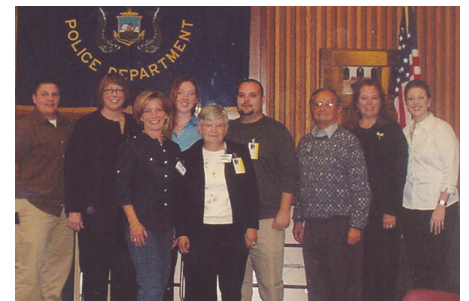
TIP Training Academy graduates, Fall 2007.